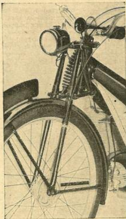
Arrangement of the new central-spring front forks

Central-spring front forks, with pressed-steel blades, are fitted. These are provided with bottom links \frac{3}{8} in thick—appreciably thicker than the top links. These unusually sturdy