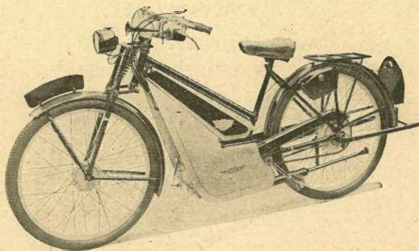
With its shielding, Argenized finish and single-tube telescopic-looking spring forks, the James "Superlux" autocycle has a most attractive appearance

TWO models comprise the James programme. These are an attractive-looking autocycle fitted with spring forks and quickly detachable sideshields and a civilian version of the 125 c.c. James "Flying Flea," which was used in hundreds for the assault on the Normandy beaches, was a main factor in controlling the handling of supplies on those beaches, and was employed by the famous 6th Airborne Division. The "go-anywhere" lightweight is thus in remarkable degree a tried, proved proposition.