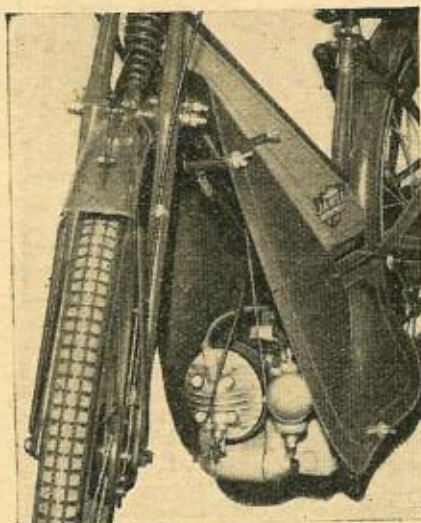
This view of the 98 c.c. autocycle shows the horizontal position of the engine and how the shields assist cooling

strangler control, with a direct and rigid action. A rod passes upwards from the carburettor and is attached to a lever which protrudes through a slot in the left-hand or near side engine shield. Position for "starting" and "running" are clearly marked on the shield. The lever, which pivots about a spindle attached to a brazing on the frame, is discouraged from lateral movement by a light coil spring. Each end of the spindle carries a wing-nut which provides an engine-shield fixing.